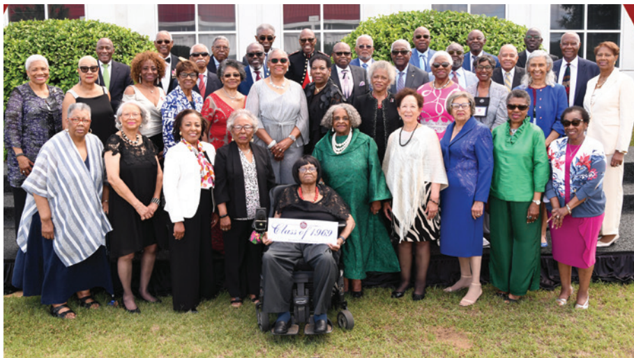
Class of 1969

South Carolina State University proudly acknowledges these classes for their leadership and steadfast support of the university.