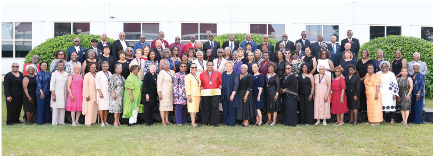
Class of 1974