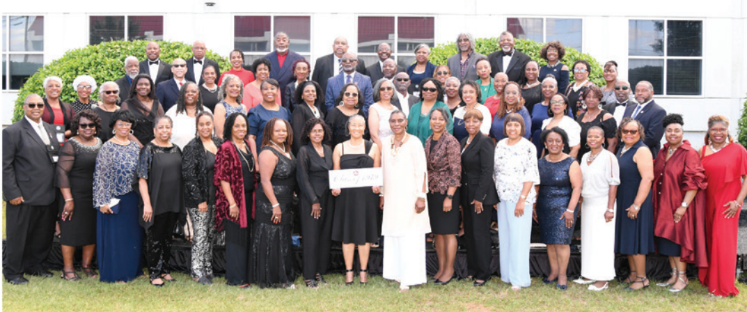
Class of 1979