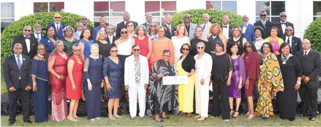
Class of 1984