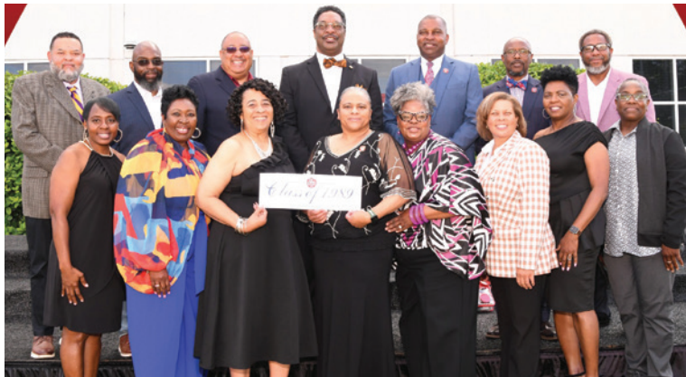
Class of 1989